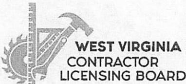
Chair, West Virginia Contractor Licensing Board

A copy of this license must be readily available for inspection by the Board on every job site where contracting work is being performed. This license number must appear in all advertisements, on all bid submissions, and on all fully executed and binding contracts. This license is non-transferable. This license is being issued under the provisions of West Virginia Code, Chapter 30, Article 42.